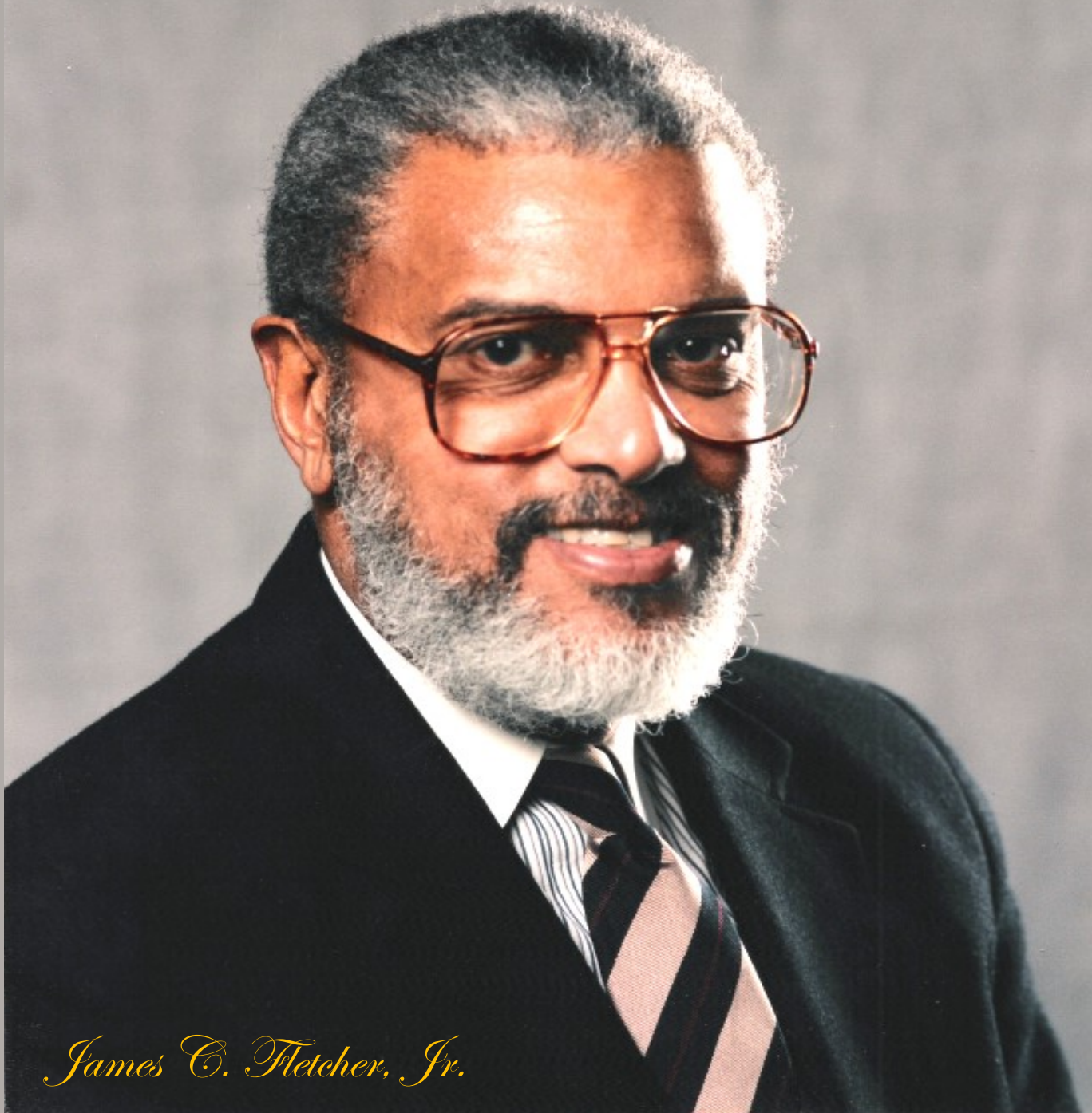
James C. Fletcher, Jr.