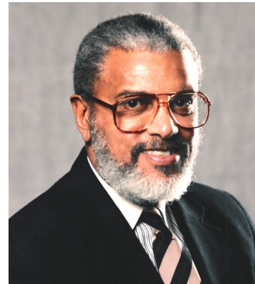
James C. Fletcher, Jr.